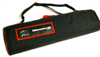
Ships FedEx & UPS